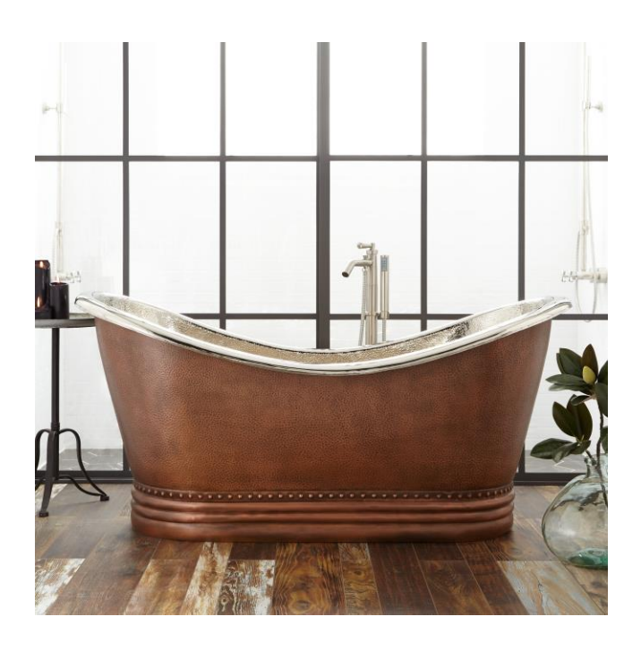
CSA B45.12/IAPMO Z402

Code: SH480172, SH474279, SH474280, SH474281, SH474285