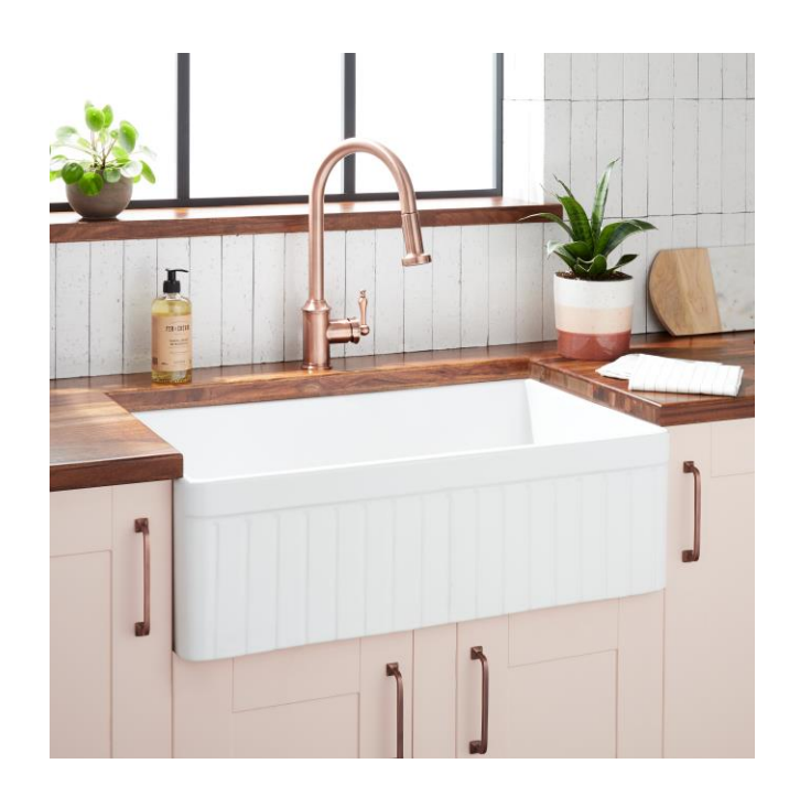
ASSE 1016 Type P/T