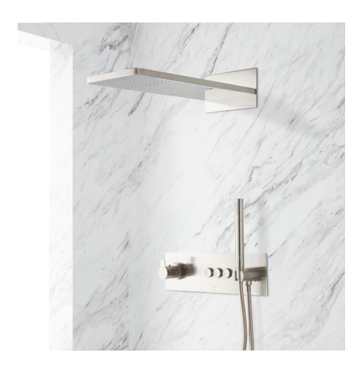
ASME A112.18.1/CSA B125.1